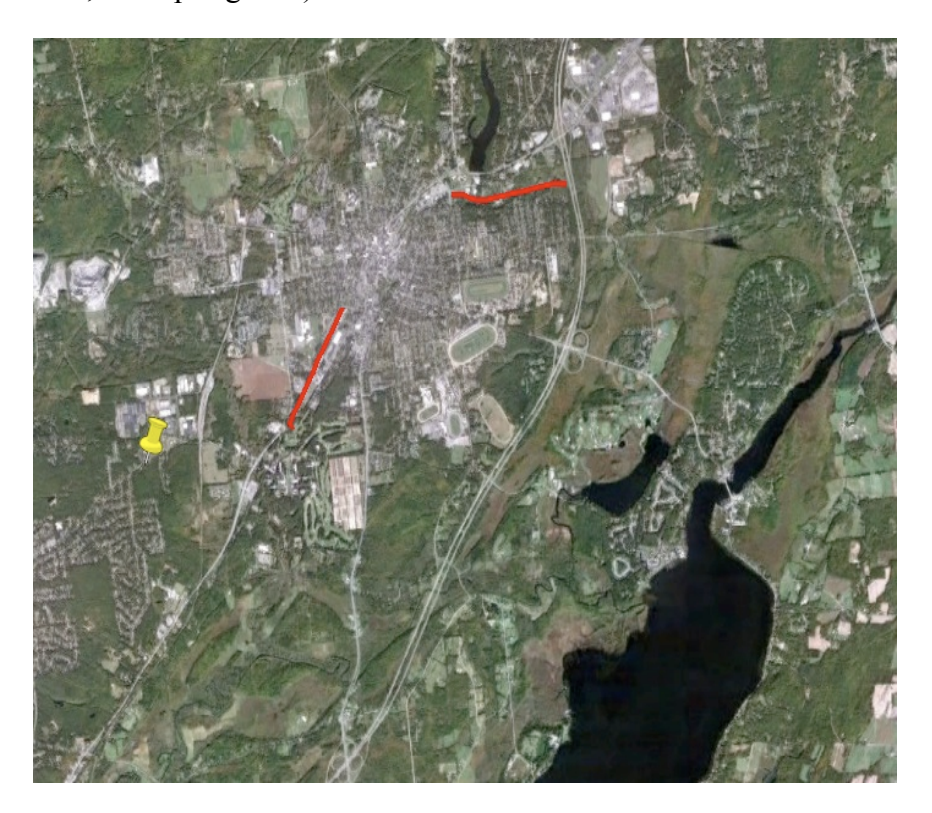
Figure 2: Greenbelt Trail Concept