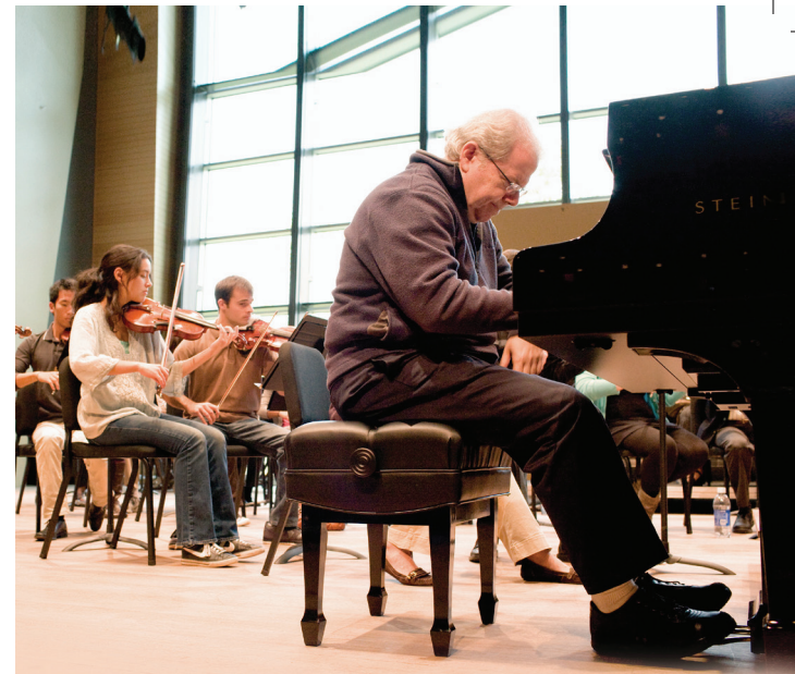
Skidmore musicians perform alongside pianist Emanuel Ax.

In recent years, students have enjoyed private lessons and master classes with talents such as Ensemble Connect, soprano Heidi Grant Murphy, saxophone player Joshua Redman, flutist Paula Robison, jazz vocalist Nnenna Freelon, pianist Brad Mehldau, Pulitzer-winning composer Caroline Shaw and the Ying Quartet. Other legendary artists have performed at Skidmore, including the Kronos Quartet, pianist Garrick Ohlsson, pipa player Wu Man, jazz great and composer Terence Blanchard and the Los Angeles Guitar Quartet.