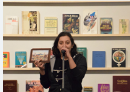
You are a Collector

While the plan is to continue these monthly storytelling events in the new semester, we are also thrilled to announce next semester's programming theme: Cosmic Tones: Mapping the Musical Multiverse in Documentary . We hope you'll stay tuned to learn more about this season-long arc of daring nonfiction events (plus many associated musical happenings) that offer you an entry and a map to some otherworldly music. Like us on Facebook and watch the event details roll in as they get confirmed.