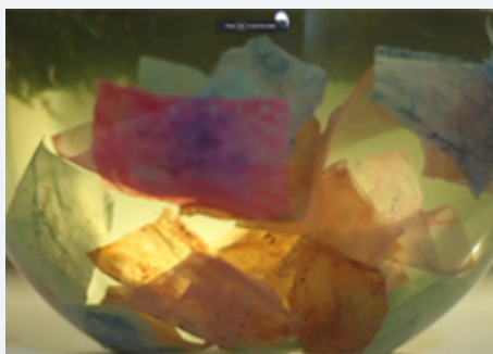
Nov. 12 DS Faculty Showcase

Fall semester is in full swing, and there's lots to report on from our busy calendar. In all that we do, MDOCS seeks to foster a culture of storytelling on campus and in collaboration with our community partners. We wrap up this semester with two upcoming events featuring storytelling: