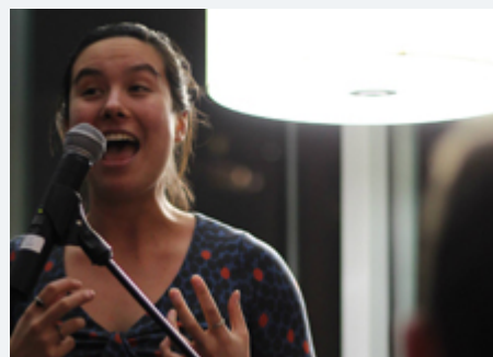
Nov. 28 From the Horse's Mouth

In MDOCS's first-ever faculty showcase event (Nov 12), we highlight time-based work that ranges in genre from quiet observational cinema set in a chilly desert landscape, to intimate essay filmmaking from the edges of New York City, to a modern sci-fi radio drama set on a journey between the stars. Our eminent MDOCS faculty members make genre-busting, hypnotizing work, and we can't wait to share it with you.