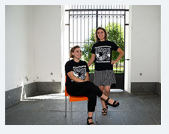
Filmmakers in residence present on 360 VR and community collaboration

Applications now open for the 2020 Storytellers' Institute & Forum! This year's theme is <u>Co-Creation and its</u> <u>Discontents</u>. Apply in collaborative pairs that span disciplines or with projects in collaboration with communities or institutions. Deadlines: 10/24 (Skidmore Students); 12/4 (General)