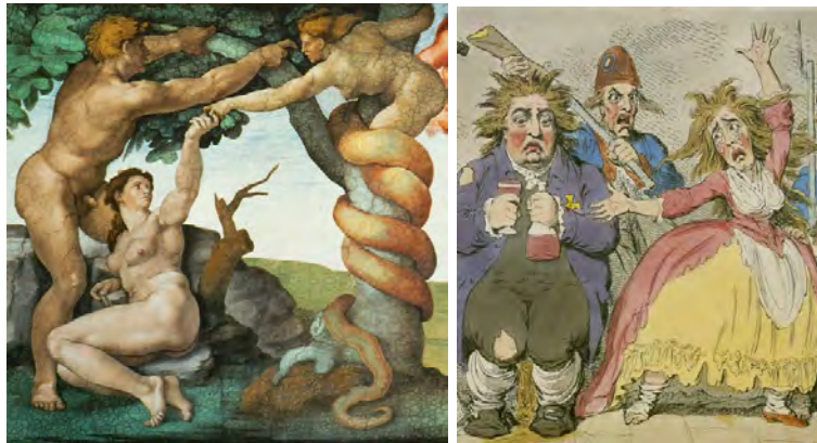
Left: Michelangelo, Detail of a scene from the Bible (painting, Italy, 1510s). Right: James Gillray, Detail of a political satire (print, France, 1790s).