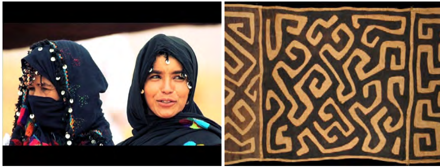
Left: Amazigh Women. Right: Kuba Cloth.

Lara Ayad | 4 credits | TR 9:40-11:00 + M 9:05-10 or 10:10-11:05