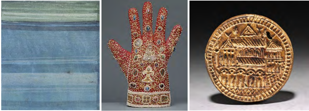
Left to right: 'Colorfield' page from a liturgical book (Germany, 10 th century); jeweled glove for the Holy Roman emperor (Italy, 13 th century); wooden bread mold with an image of the Holy Sepulchre church in Jerusalem (Palestine, 7 th -10 th century).

Nancy Thebaut | 3 credits | TR 3:40-5:00