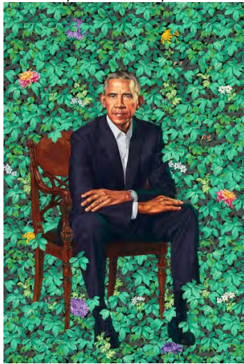
Kehinde Wiley, President Barack Obama , oil painting, 2018.